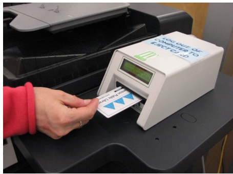
Insert copy card into copier/scanner.

It's easy to scan a document to your email with our copier/scanner. Although this is a free service, you will need a copy card.