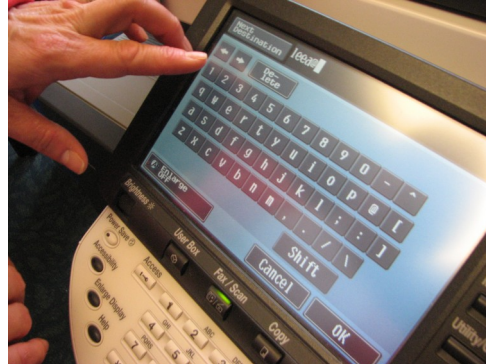
Type in the e-mail address and press "OK".