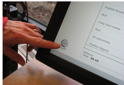
When you are finished, be sure to select the "logoff" button to remove your card.