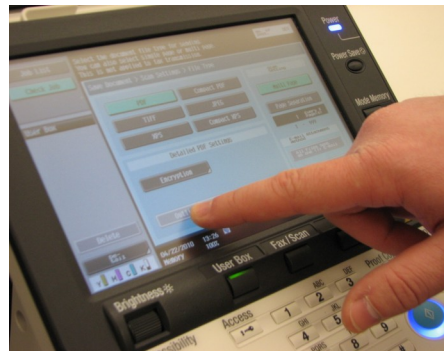
Select the Fax/Scan button. Change the format of the document here.