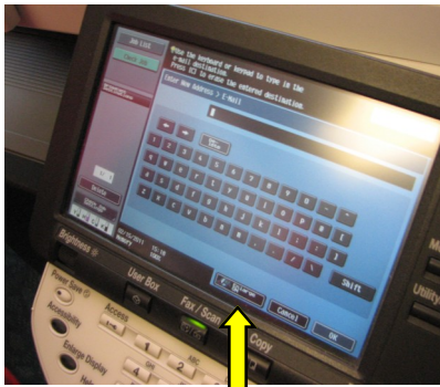
Select "Enlarge On" to enlarge the keyboard.