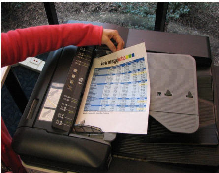
OR, place item to be scanned FACE UP on top feeder.