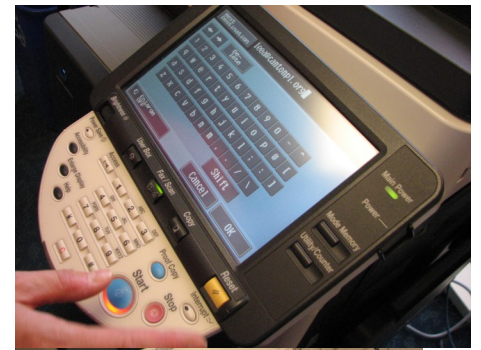
Press "Start" and scanning will begin.