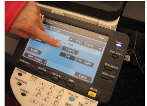
Select the E-Mail button.